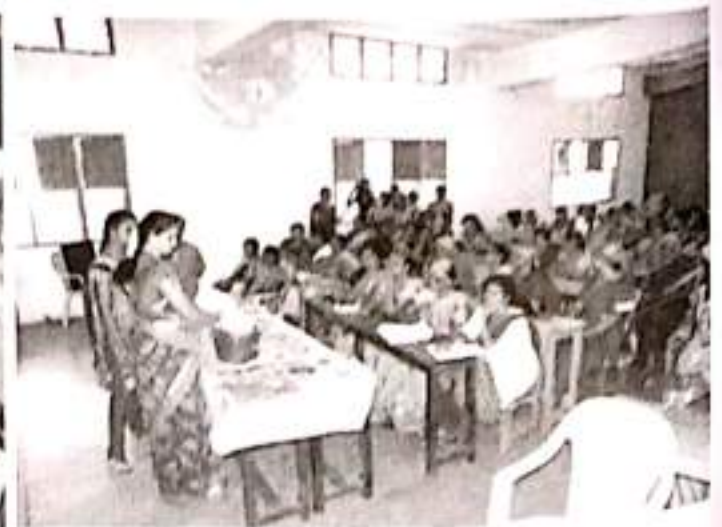
Hands-on Training on Honeybee Rearing for young entrepreneurs Date: 9-9-2017 Self-Employment Training for Rural Women and Women self-help group members Date: 22-9-17