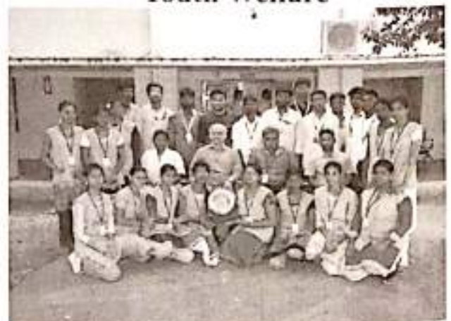
Participations of Youth Festival