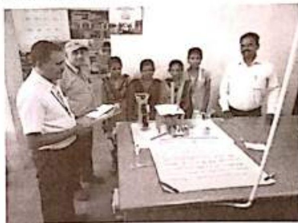
Project done by Students