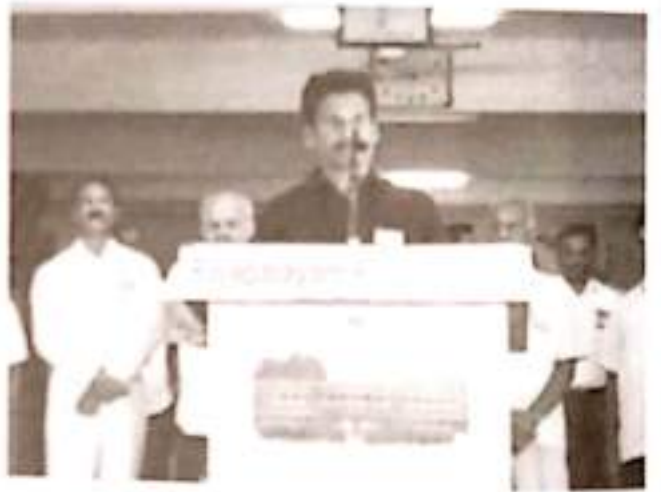
Independence Day Address