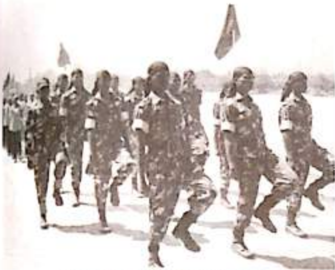
March Past (Obstact)