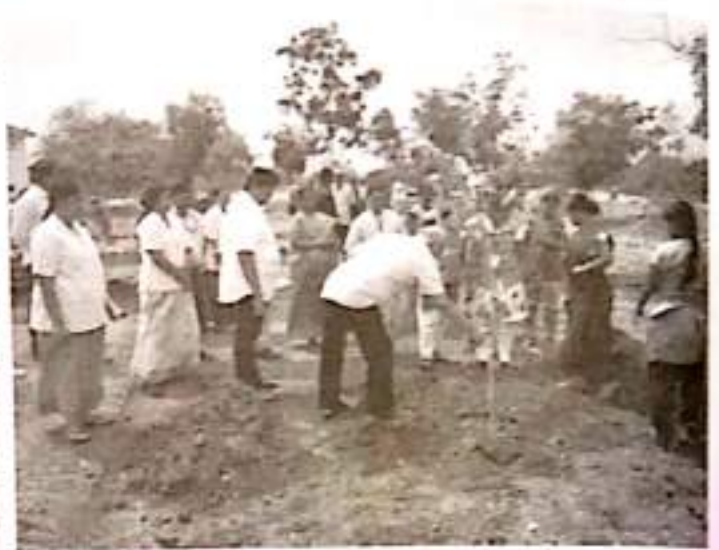
Tree Plantation Ceremony Celebrating Women's Day on 9-3-18