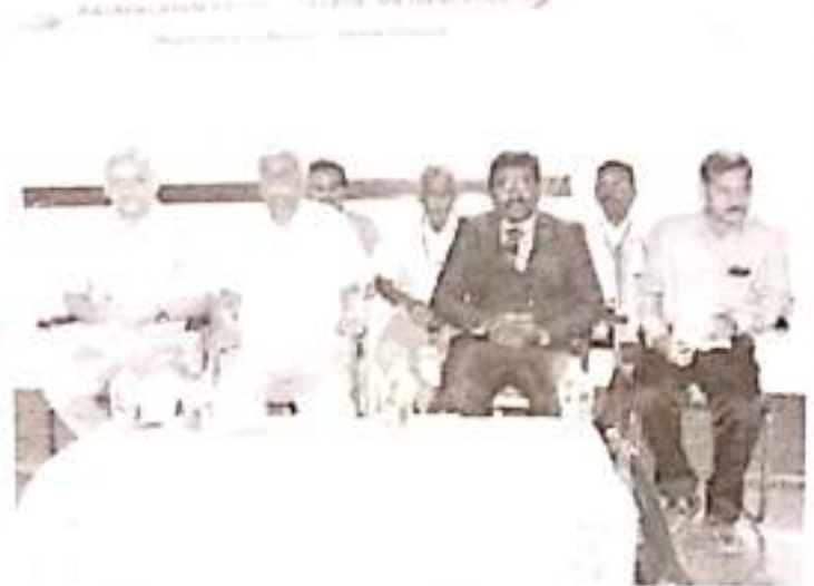
One day National Conference on " Innovative strategies of Knowledge Management for Sustainable Development" on 16-2-2018