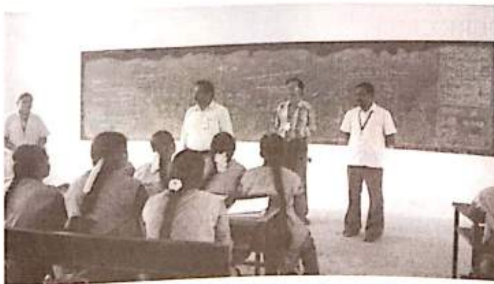
A seminar on "GST" on 14-7-2017.