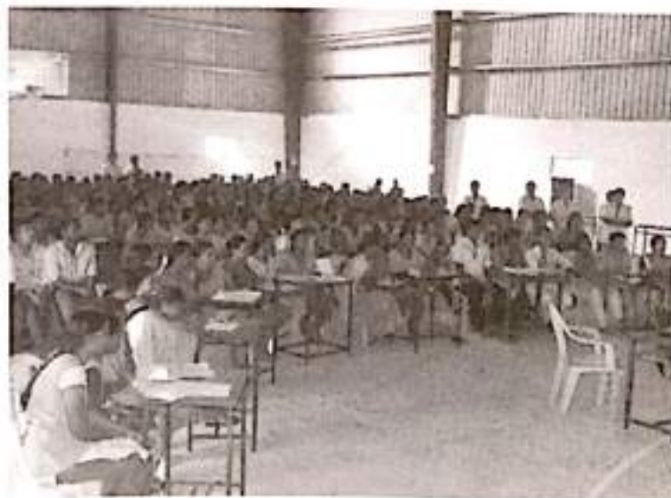
District Cluster of colleges Joint programme in Mathematics, the Department organized a Quiz Programme