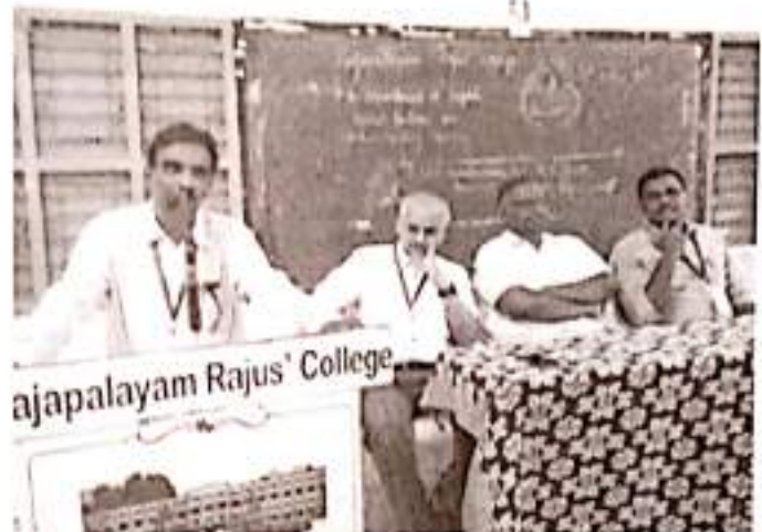
Tagore Literary Association inauguration