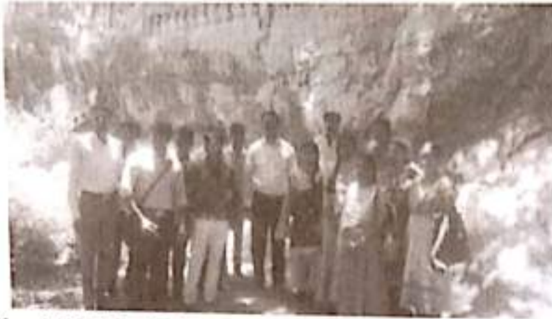
Historical field visit at Vettuvan kovil, Kalugumalai.