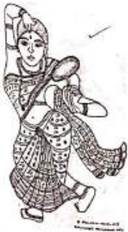
சே. கதி 1/1/2019