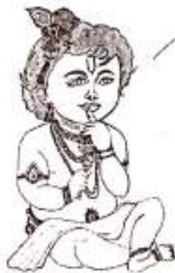
சே. கதி 1/1/2019