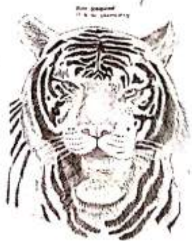
சே. கதி 1/1/2019