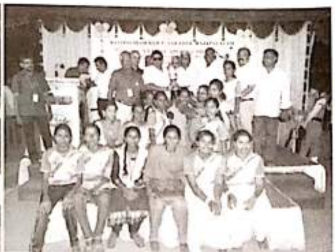
Overall Champion Narmatha House