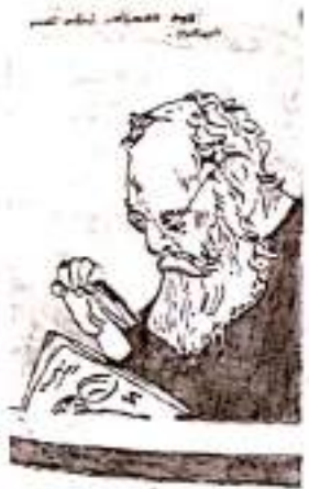
சே. கதி 9/1/2019