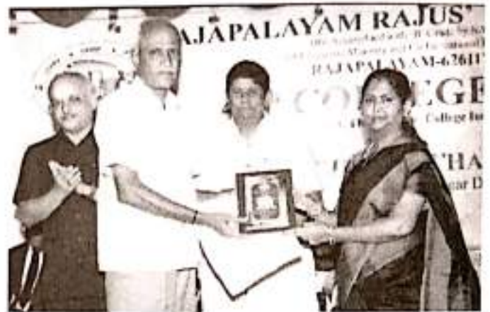
K. Alagar Tamil Department - HOD