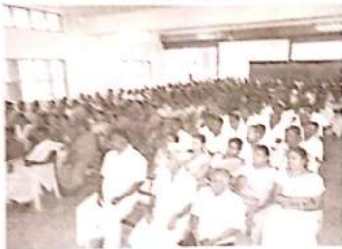
YOUTH RED CROSS