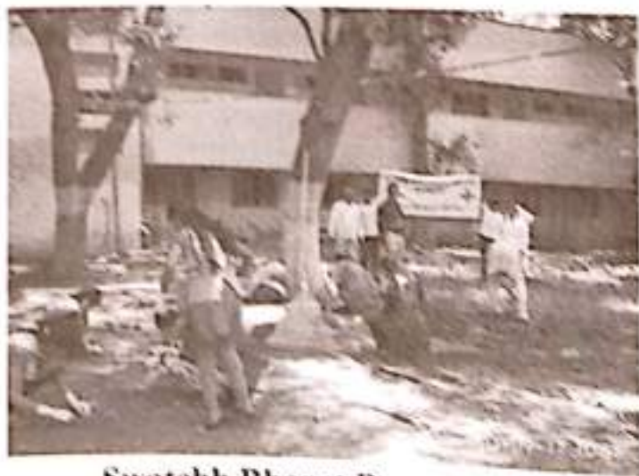
Swatchh Bharat Programme Sivananda Ashram, Ayyanarkoil.