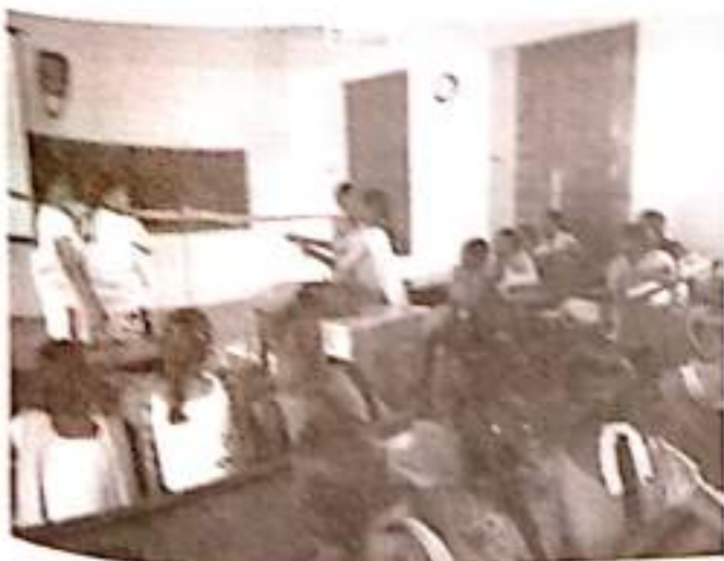
Disaster Management Rescue Measures