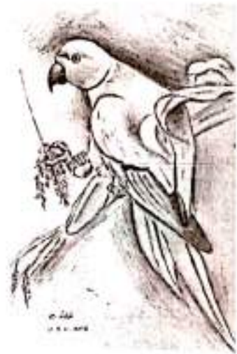
சே. கதி 1/1/2019