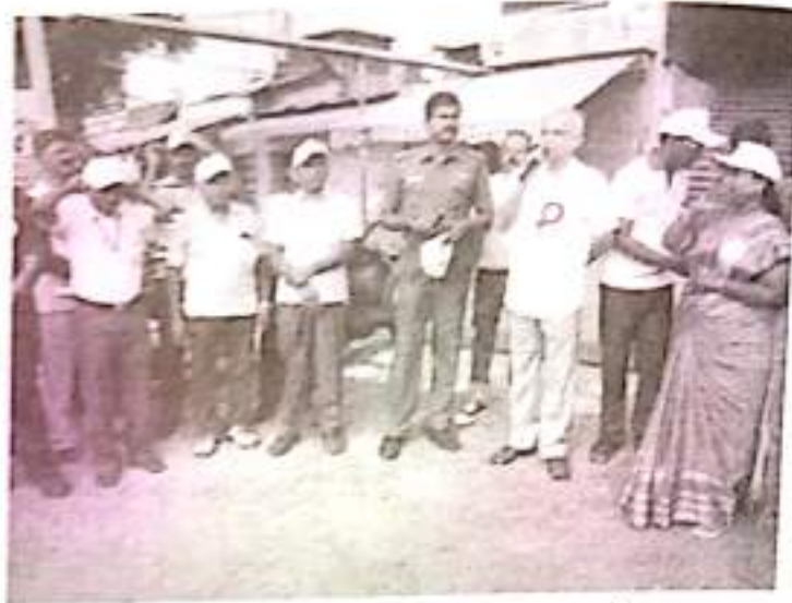
Swachh Bharat Campaign