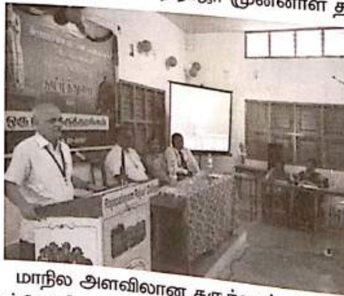
மாநில அளவிலான கருத்தரங்கம் சிறப்புச் சொற்பொழிவு : முனைவர் வெங்கட்ராமன், முதல்வர்