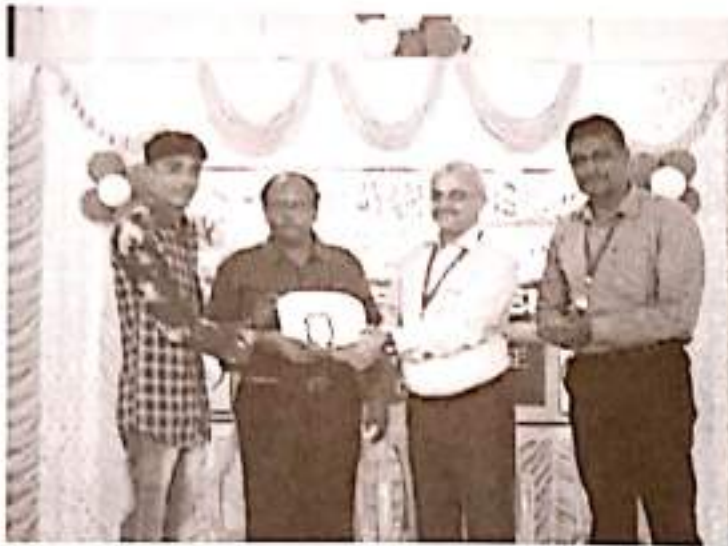
Best Student Award