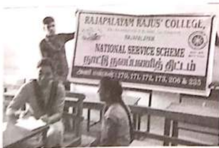
Skin Care Camp