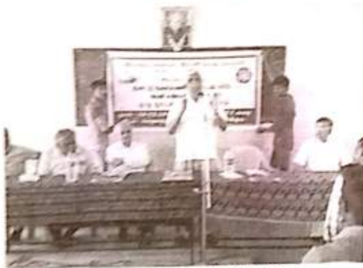
Inauguration of NSS Camp