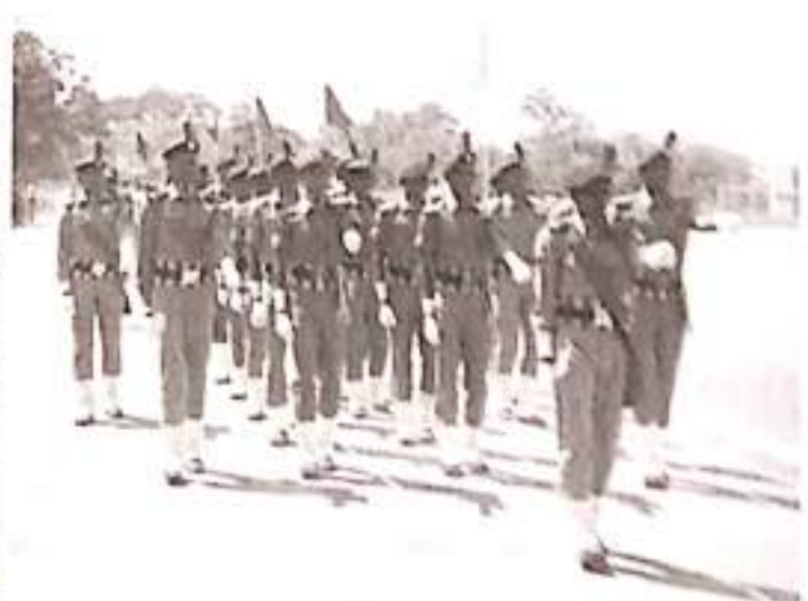
March Past (Cadet)