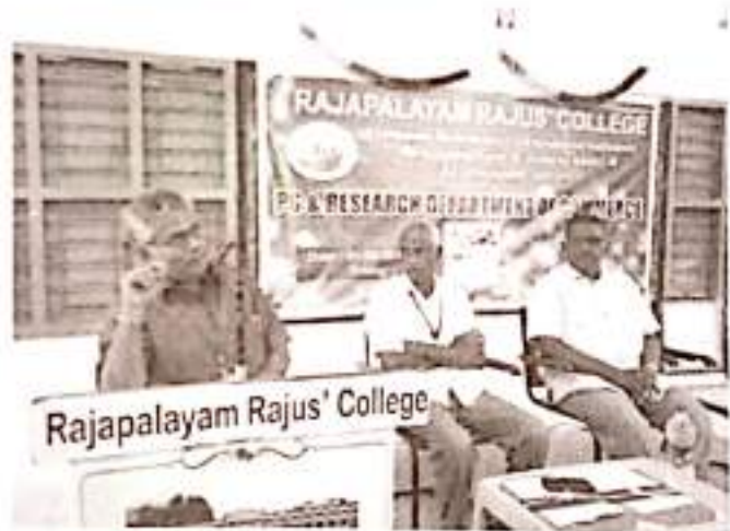
Inter Departmental Quiz programme