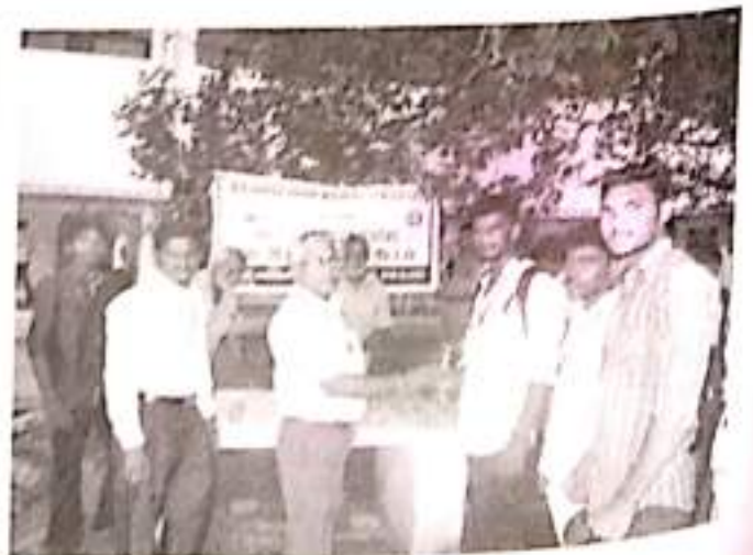
Awareness of Dengu Fever