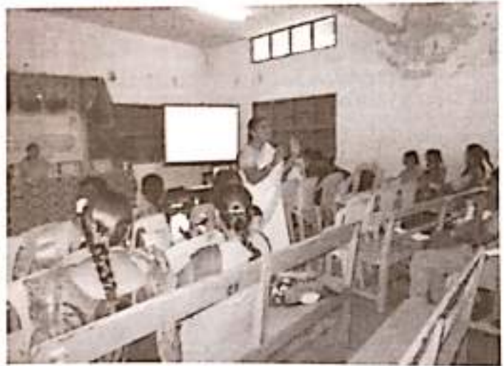
State Level Seminar on "Opportunities for Entrepreneurs in Digital India" on 23/09/2017.