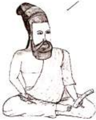
அ. கதி 8/1/2019