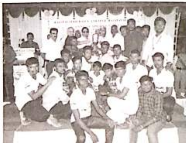
Overall Champion Bharathiyar House