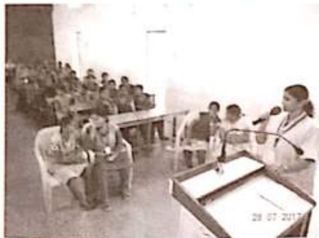
Inter Departmental Quiz programme