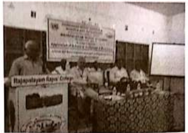
Training on Herbal plantation & Trees sapling for farmers and young entrepreneurs Date: 28-9-17.