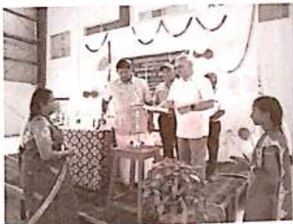
Lighting the kuthuvilaku