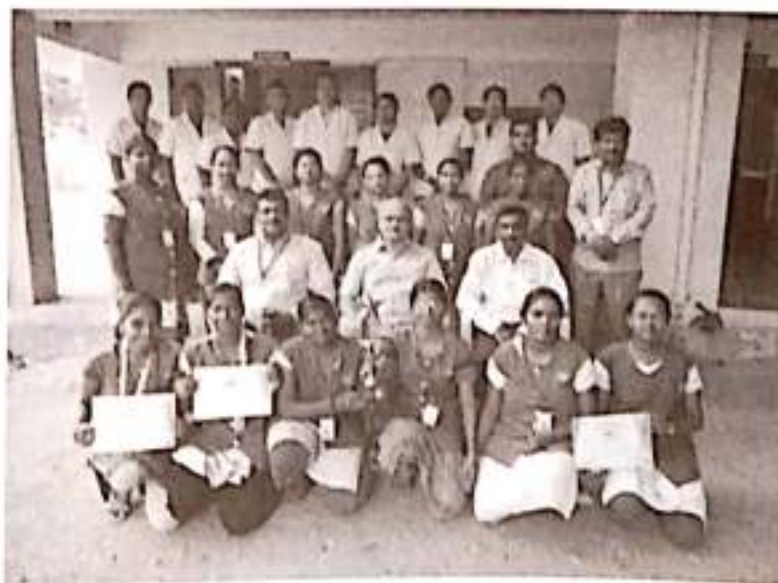
Over all Champion