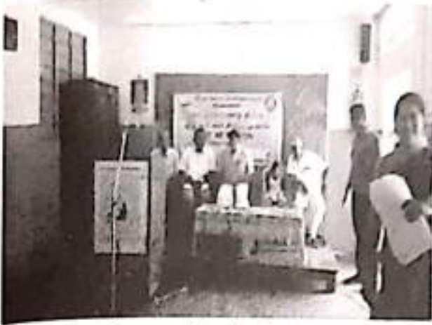
NSS Special Camp at Jothi Hr. Sec. School, Rediapati