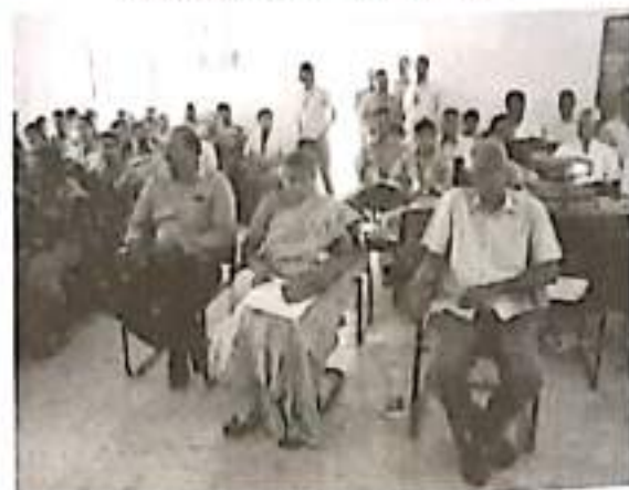
Staff and Student Participants