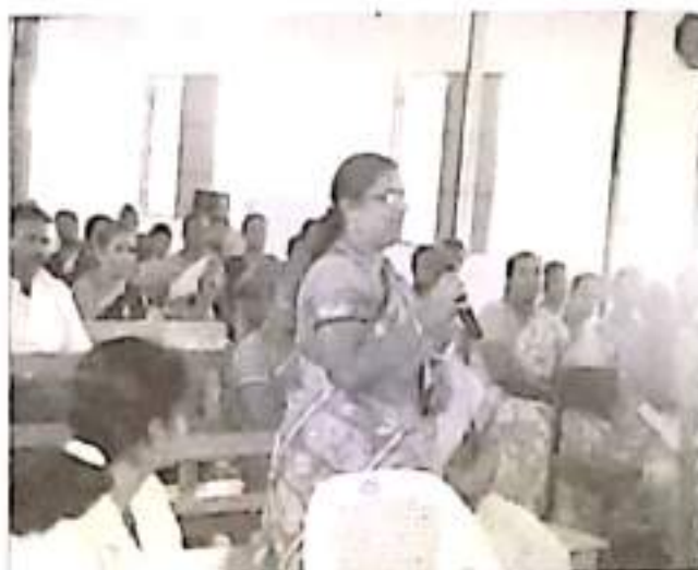
Interaction with Parents