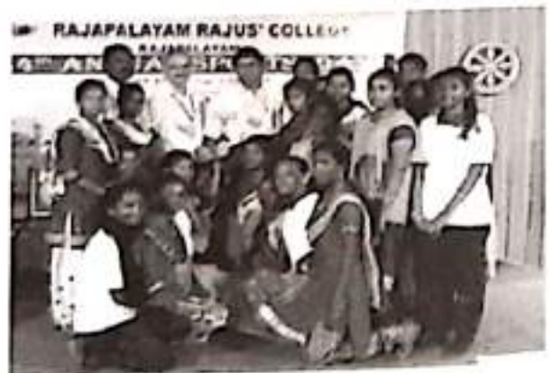
Distribution of Trophy to the Winners