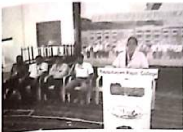
Orientation Programme on 28th June, 2016