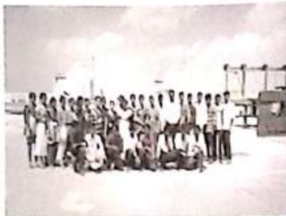
Industrial Visit Kudankulam Nuclear Power Reactor