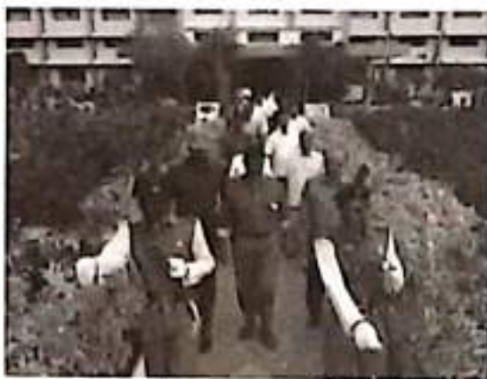
Guest of Honour to the Chief Guest