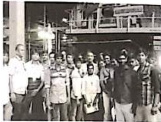
Industrial Visit to Dharani Sugars & Chemicals Ltd., Vasudevanallur on 08-02-17.