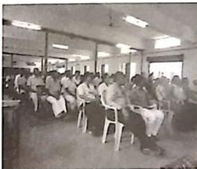
Participation of Parents