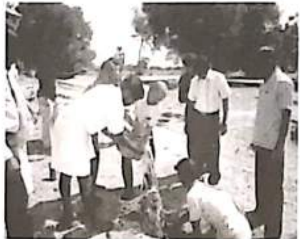
Tree Sapling at Devedhanam Village.