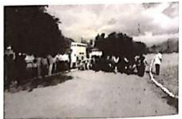
Mini Marathon for Girls