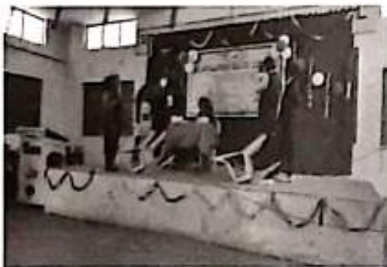
Performance in Literary Parade