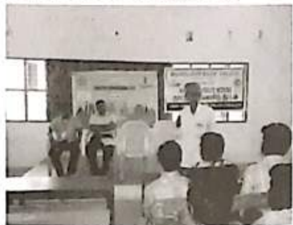
Awareness on "Swachh Bharat Mission"