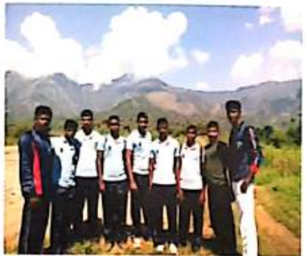
NCC Cadets in Trekking Camp