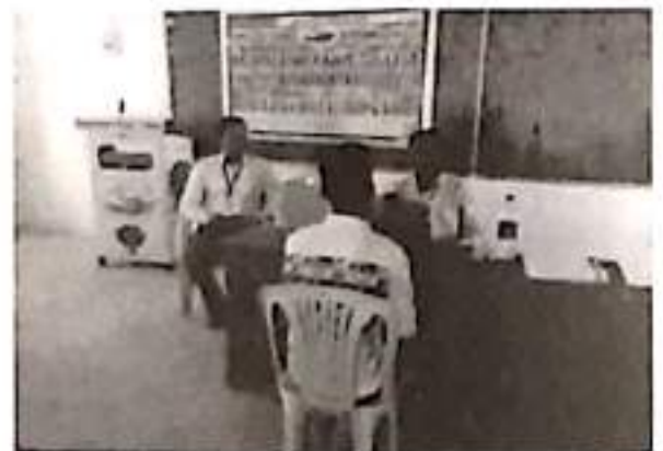
Campus Interview Duruva Foundation, Karur.