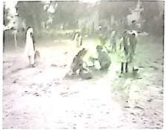
Field Work by NSS Volunteers.