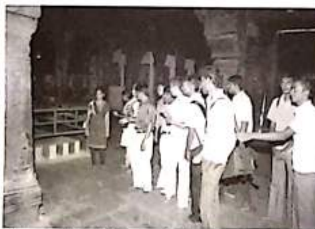
Historical Field Visit at Kazhugumalai Temple