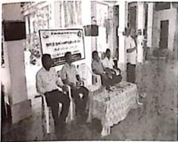
NSS Camp at Devadhanam January, 2017.