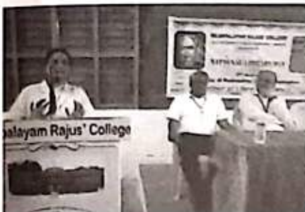
Celebration of National Library Day on 12th August 2016