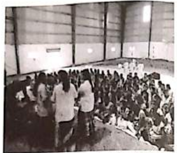
One day Workshop on Self Employment for all the III year girl students was conducted on 04-02-17