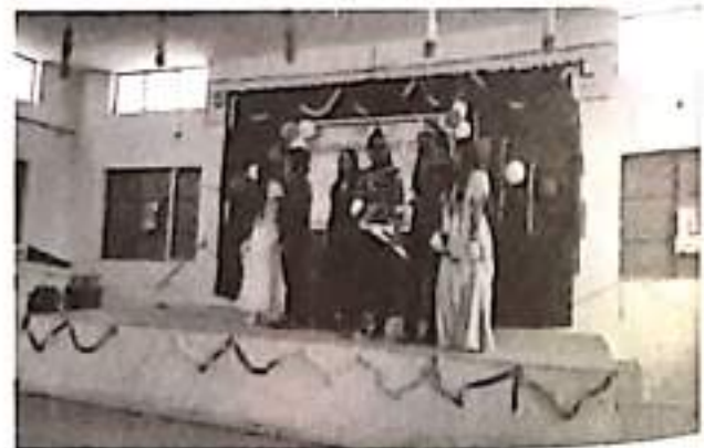
Performance in MIME Show