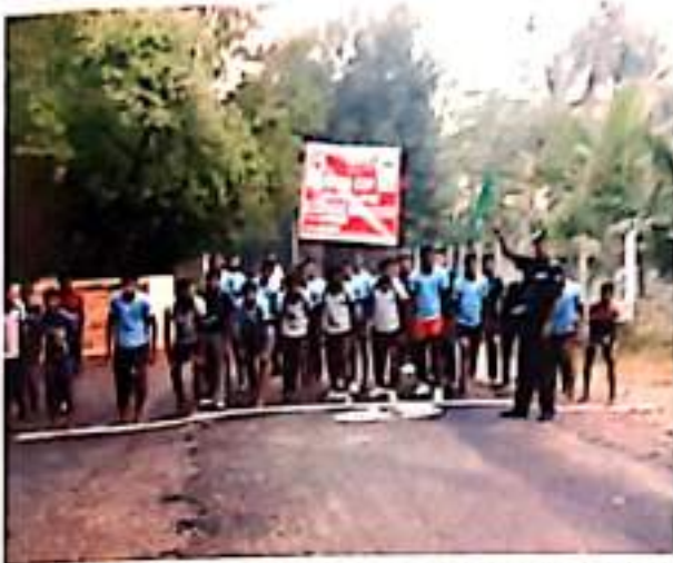
NCC Cadets participating in Mini Marathon