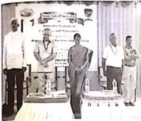
State Level Seminar on Innovative Strategies in Commerce and Management on 10-03-17.