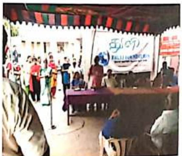
Render services to Thuli Foundation, Rajapalayam.