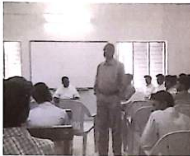
Guest Lecture on Human Rights Education