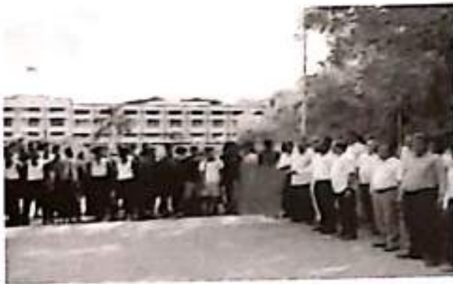
Mini Marathon for Boys