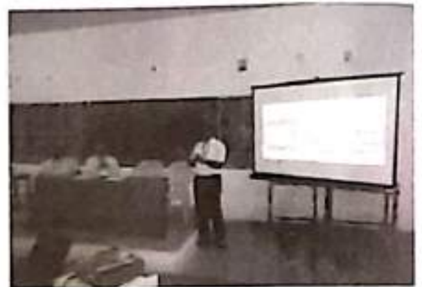
A Campaign for 'Promoting Digital Economy'