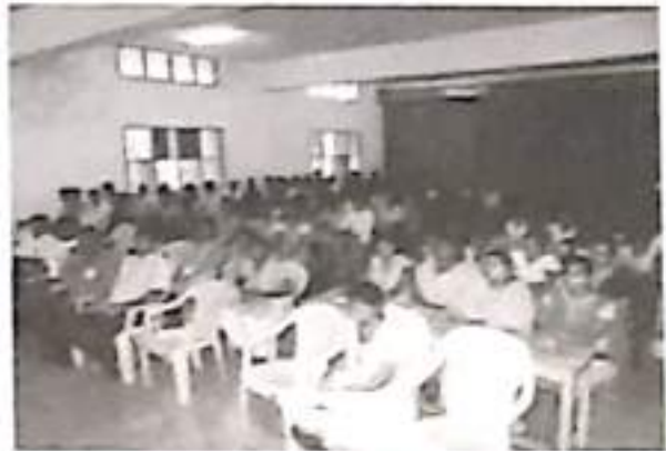
Celebration of National Library Day - Staff and Students Participants