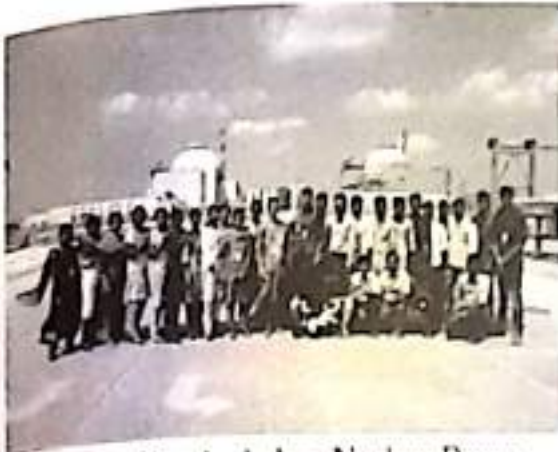
Visit to Koodankulam Nuclear Power Plant on 22-12-16.