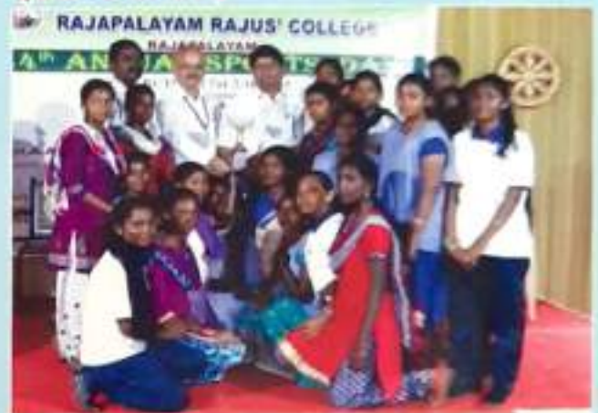
Distributing Trophy to Winners