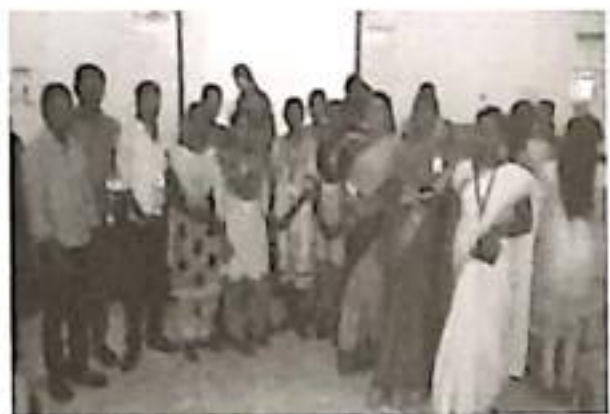
RRC Readers Forum students took part in the VVC Library Carnival-2017, STATE LEVEL INTERCOLLEGIATE MEET at VVV College for Women, Viradhunagar and won Prizes