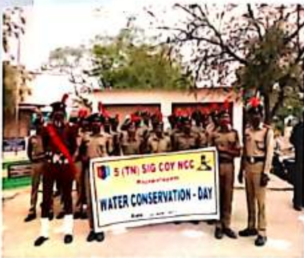
Awareness Programme on "Water Conservation Day"