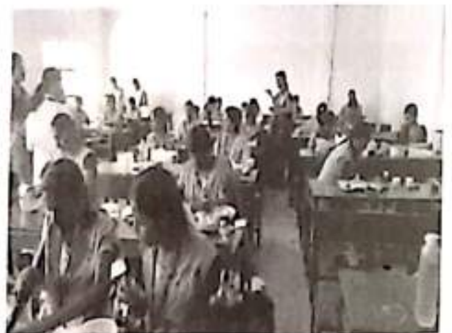
Competitions organized for the girl students