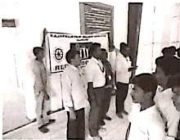
Volunteers observing oath on National Youth Day