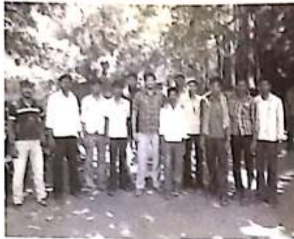
EVS Visit to Ayyanarkoil, Rajapalayam.